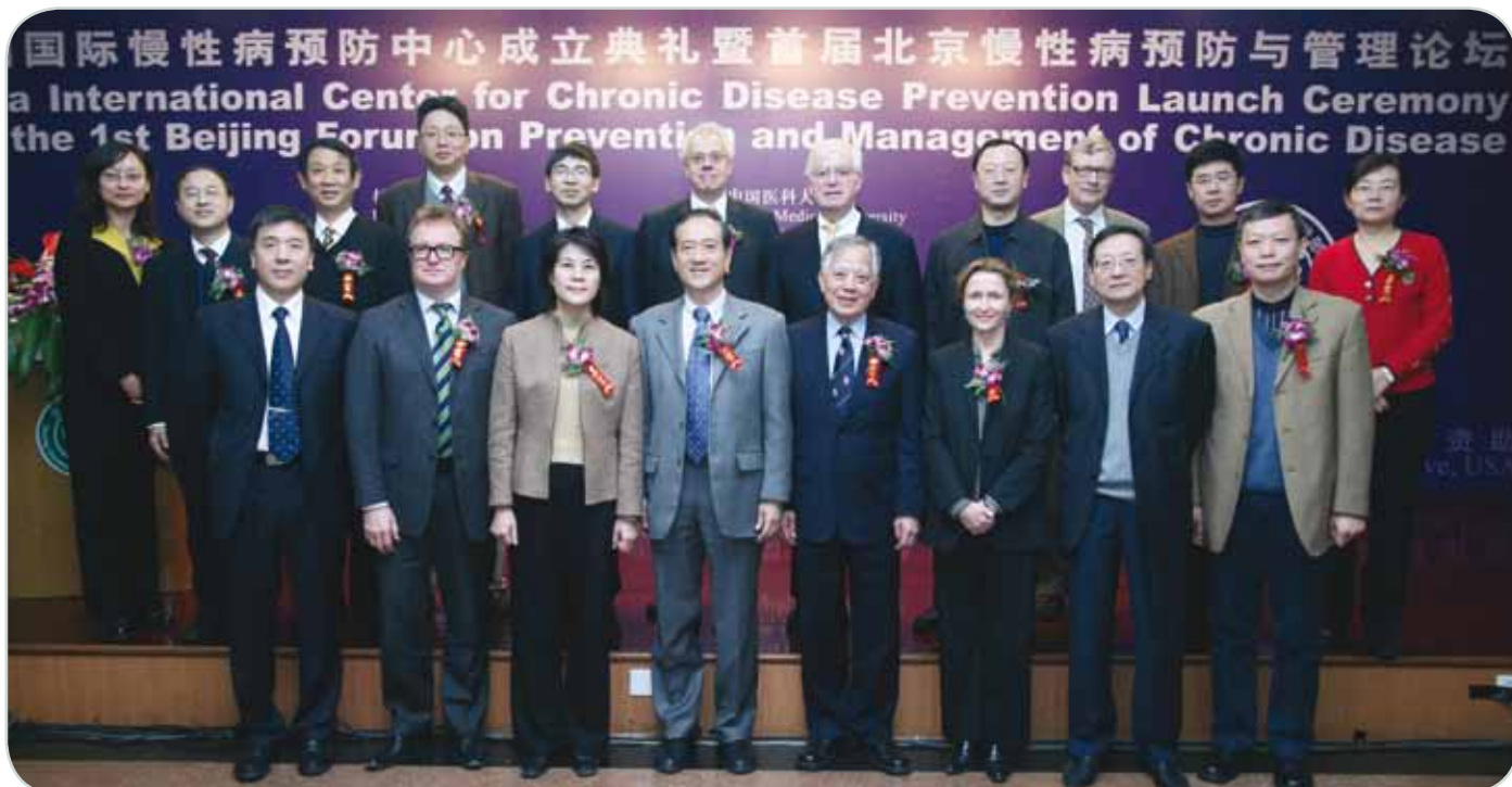
Senior delegates at the inaugural Beijing Forum on Chronic Disease

THE GEORGE INSTITUTE, CHINA HOSTED THE FIRST ANNUAL BEIJING FORUM ON THE PREVENTION AND MANAGEMENT OF CHRONIC DISEASE IN NOVEMBER 2009. THE FORUM PROMOTED FURTHER DEVELOPMENT OF CHRONIC DISEASE PREVENTION AND CONTROL IN CHINA, AND FACILITATED EXCHANGE OF INTERNATIONAL EXPERTISE. THE THEME OF THE FORUM WAS 'GLOBAL RESPONSES TO THE CHALLENGE OF CHRONIC DISEASES'.